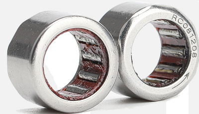
AISI52100 chrome Steel