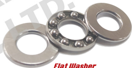
Flat Washer (No Raceway in Washer)

This bearing print is for technical reference and is displaying on www.clibearings.com ONLY!