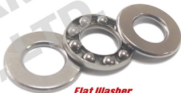
Flat Washer (No Raceway in Washer)

This bearing print is for technical reference and is displaying on www.clibearings.com ONLY!