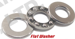
Flat Washer (No Raceway in Washer)

This bearing print is for technical reference and is displaying on www.clibearings.com ONLY!