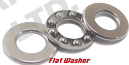
Flat Washer (No Raceway in Washer)

This bearing print is for technical reference and is displaying on www.clibearings.com ONLY!