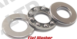
Flat Washer (No Raceway in Washer)

This bearing print is for technical reference and is displaying on www.clibearings.com ONLY!