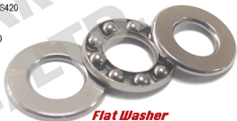
Flat Washer (No Raceway in Washer)

This bearing print is for technical reference and is displaying on www.clibearings.com ONLY!