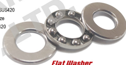
Flat Washer (No Raceway in Washer)

This bearing print is for technical reference and is displaying on www.clibearings.com ONLY!