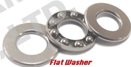
Flat Washer (No Raceway in Washer)

This bearing print is for technical reference and is displaying on www.clibearings.com ONLY!