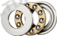
Grooved Raceway in Washer

This bearing print is for technical reference and is displaying on www.clibearings.com ONLY!