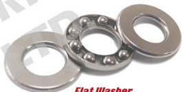
Flat Washer (No Raceway in Washer)

This bearing print is for technical reference and is displaying on www.clibearings.com ONLY!