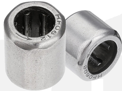
SAE52100 Chrome Steel