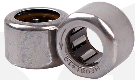
SAE52100 Chrome Steel