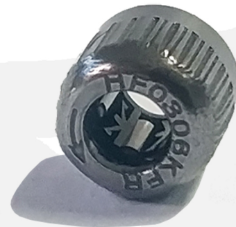
SAE52100 Chrome Steel