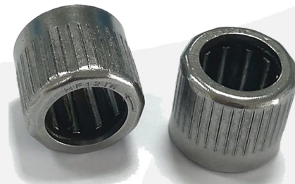
SAE52100 Chrome Steel