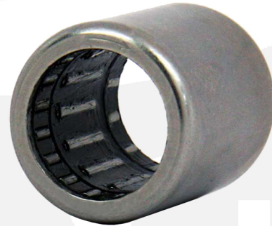
SAE52100 Chrome Steel