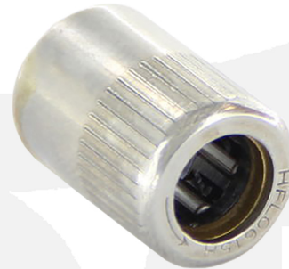
SAE52100 Chrome Steel