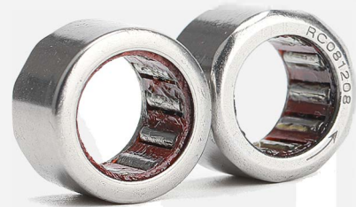
AISI52100 chrome Steel